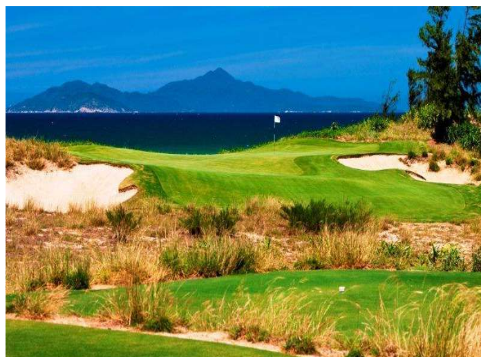
Da Nang Golf Club designed by Greg Norman