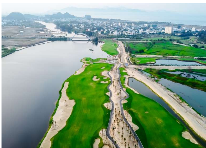
Hoiana Shores designed by Robert Trent Jones Jnr